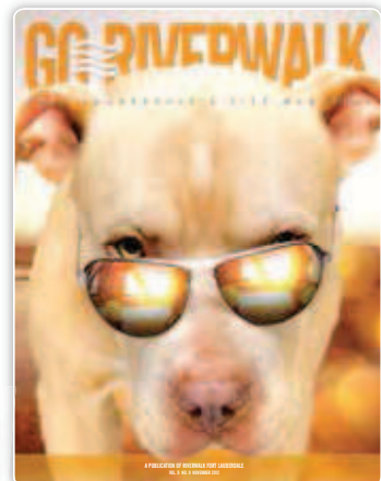
A Publication of Riverwalk Fort Lauderdale